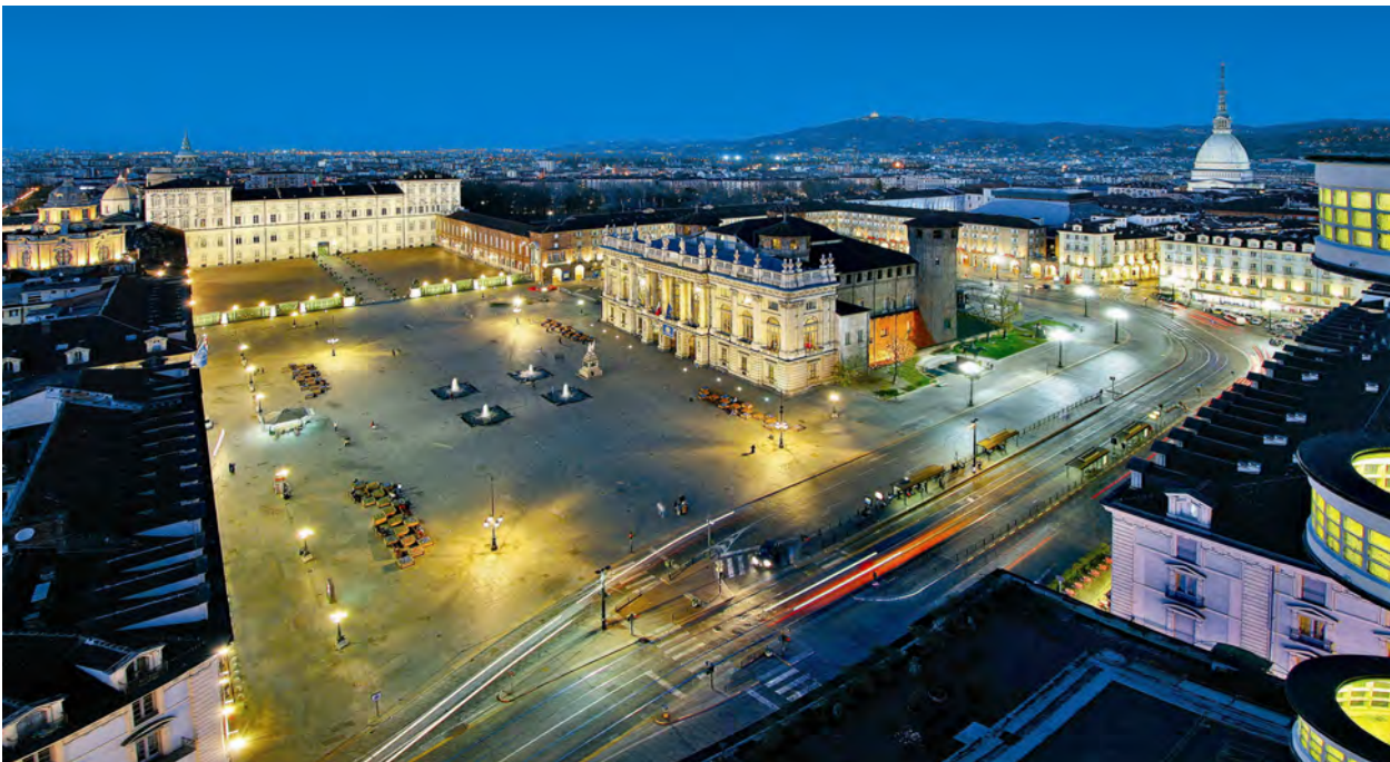
A night view of Piazza Castello, Torino's heart

The ECMP 2020 Organization reserves the right to modify, cancel and limit any exhibiting or supporting opportunities included in this prospectus. In the case of variations, interested companies will be notified.