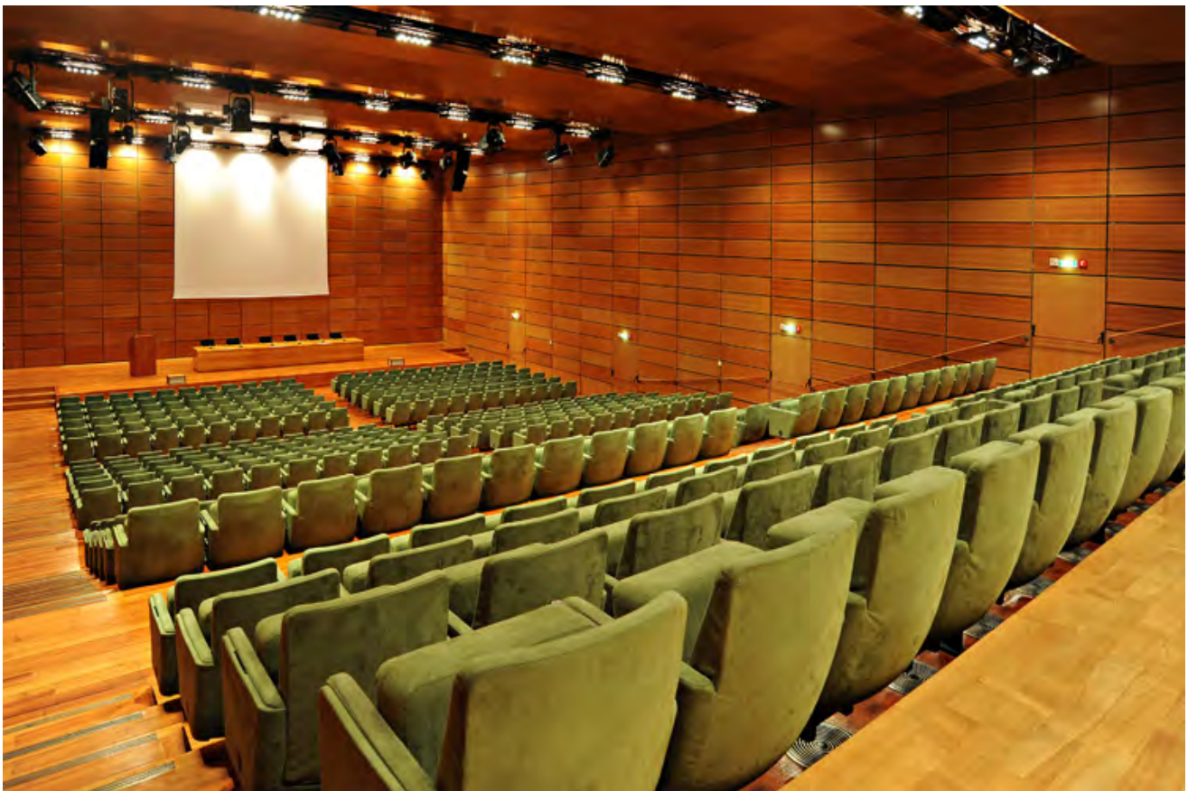
The room 500 of the Lingotto conference centre will host the ECMP 2020 plenary sessions.

See more on the Lingotto Conference Centre at www.centrocongressilingotto.it