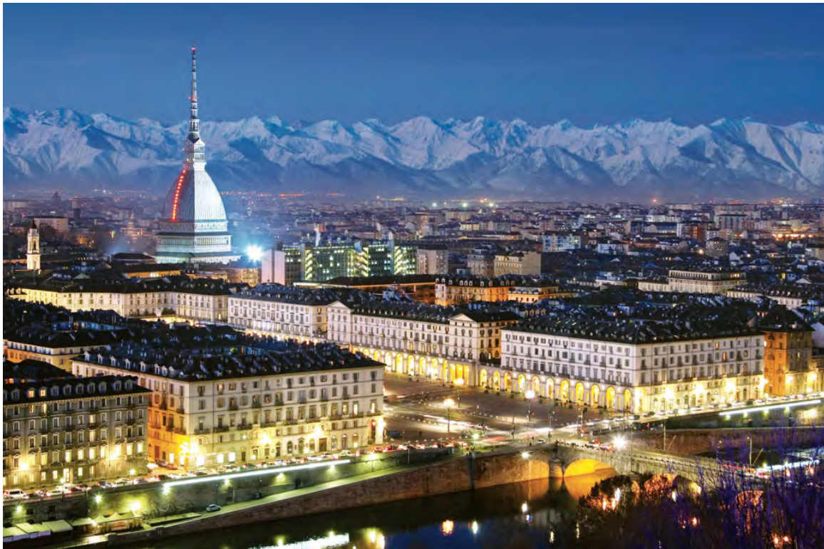
The Mole Antonelliana tower and the Alps, two symbols of Torino

5% discount on net amounts due (without VAT) will be granted to main supporter package requests submitted by March 30, 2020