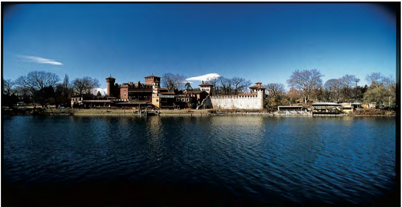
A nice view of Medieval Village and Valentino Park from the river Po.

For more info on the hosting city, please visit www.turismotorino.org